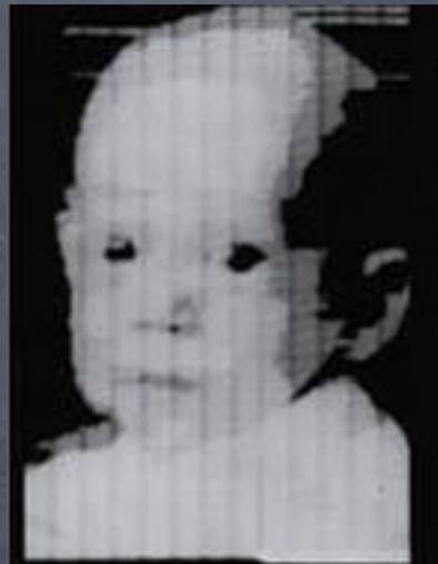
First digital image on SEAC in 1957