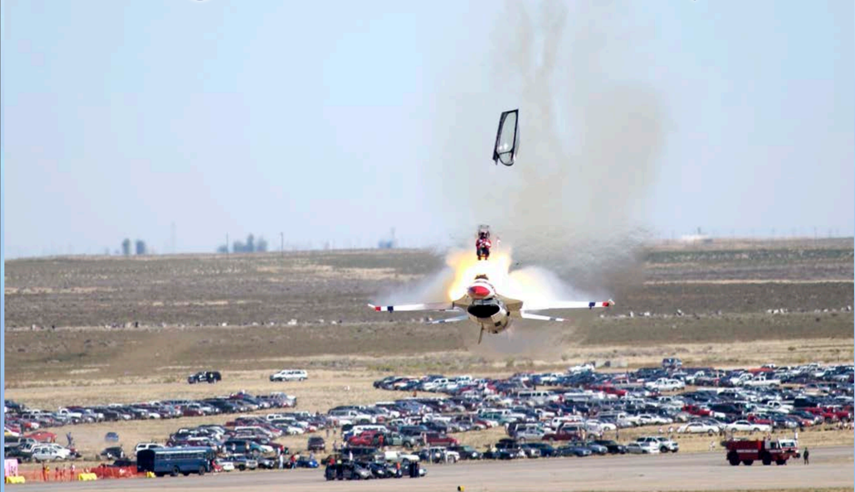
Starting With False Assumptions

Photo of Air Force Thunderbirds Falcon F-16 shortly before crash at Mountain Home Air Force Base, Idaho. The pilot had set his ground indicator at an air base with a lower altitude, and after doing a high-energy maneuver at Mountain Home AFB, found himself much closer to the ground than he planned. He had minor injuries; the $30 million aircraft was destroyed.